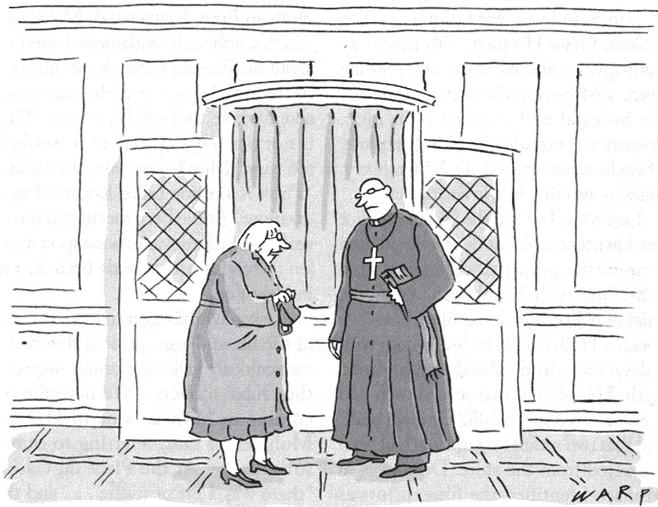
“Of course, my confessions probably aren’t nearly as interesting as yours.”