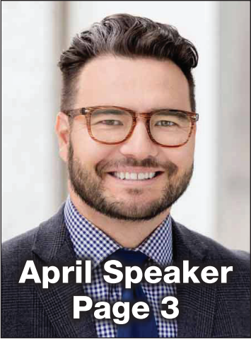
April Speaker Page 3

NEWSLETTER OF THE LAKE SUPERIOR FREETHINKERS